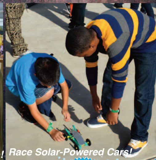
Race Solar-Powered Cars!