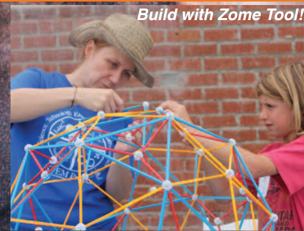
Build with Zome Tool!