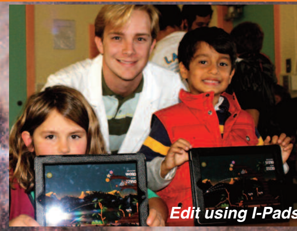
Edit using I-Pads!