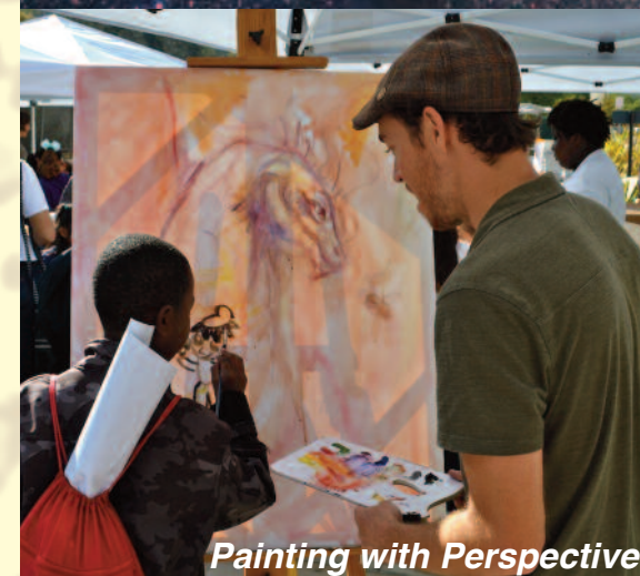
Painting with Perspective!