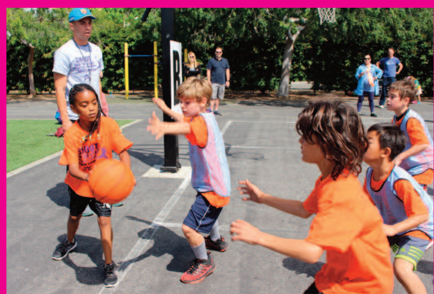
Toe-to-toe on the court at the Shoot for the STARS basketball tournament!