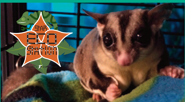
Come to the STAR Eco Station and meet Kona, the Sugar Glider and her friends!